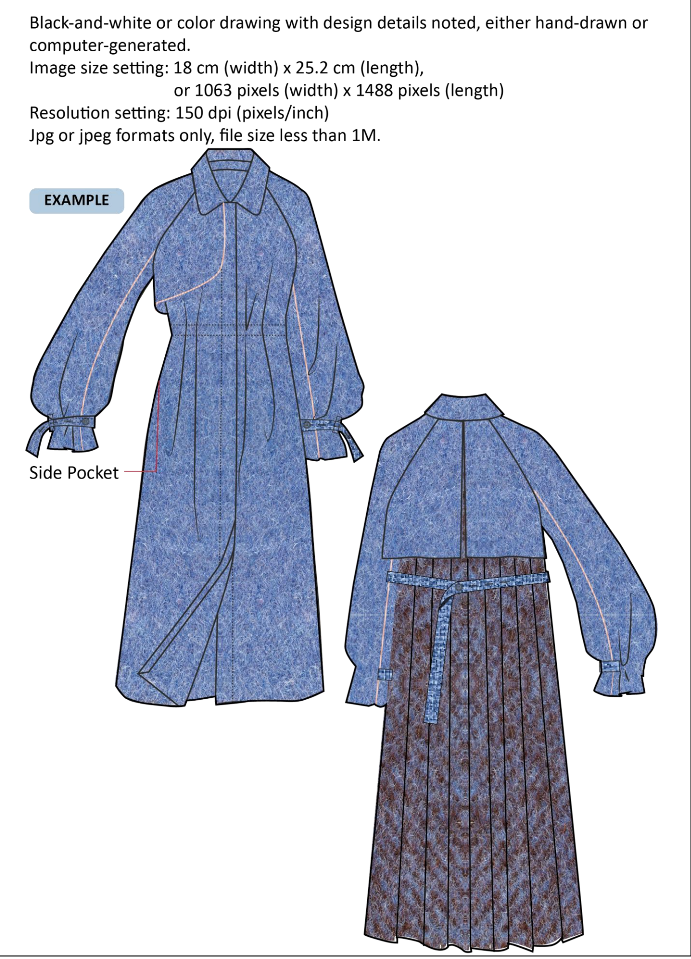
Note: (Please specify here any special way of wearing if necessary)